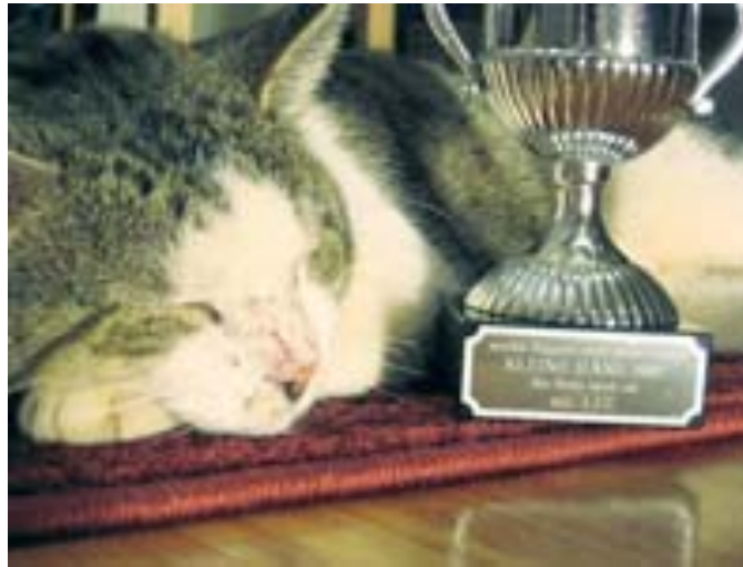
Mr Lee with the 2007 Kleine Hans